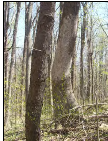
Black cherry on left, yellow poplar (also known as tulip tree) on right.

In 32 or so more steps, Two trees you'll find, again, on left. Their bark allows you to ID Even when there ain't no leaves.