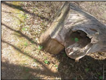
Ginger in tree hollow to right along trail.

Mystery #2: Ahead on the right a fallen tree In the hollow a heart-shaped leaf. Wild ginger, leave it be. It's not the kind we use in _____.